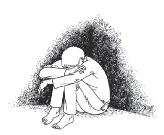
(The image is not supposed to be of a homeless person)