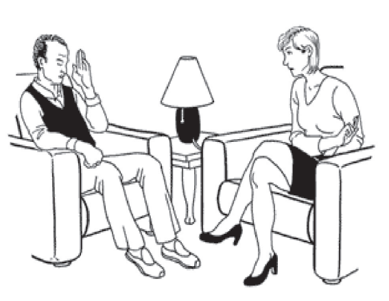
(This image is not supposed to be a man being rude – putting his hand up and ignoring the lady)